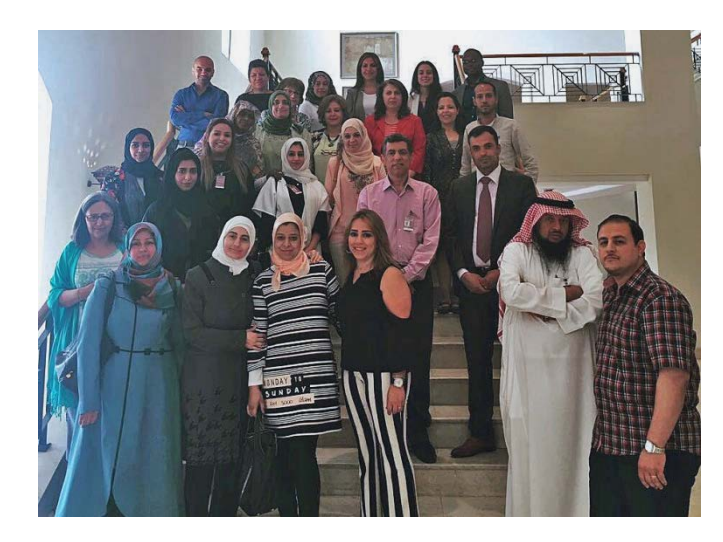
EGM on Gender Statistics in Jordan

The 4th Inter-agency and Expert Group Meeting on Gender Statistics (IAEGM-GS) in the Arab Region, was held on 9 and 10 May 2016 in the Dead Sea, Jordan. The meeting discussed gender-related issues in the Arab region and reviewed the state of development of gender statistics for evidencebased policy making. It aimed at strengthening coordination and cooperation to produce relevant gender statistics for policy making; sharing experiences on new collection tools to produce relevant information for monitoring and reporting on gender issues; improving measurement methods to analyse gender statistics for effective programme and policy making; and discussing good practice in capacity-building activities and dissemination methods.