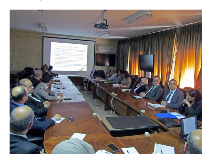
Advisory Service Mission to Jordan

ESCWA collaborated with the Partnership in Statistics for Development in the 21st Century (PARIS21) in reviewing the National Statistical Strategy of Jordan, in response to a request by the Jordanian Department of Statistics (DOS). The advisory mission which took place during 17-21 July 2016 engaged with DOS official and several national stakeholders to review and assess the status of sectoral statistics in the country. Meeting discussions provided recommendations for developing a new national statistical strategy during 2017-2021. The strategy will be used by the Jordanian government to draw its future policies regarding its social and economic planning and achieving sustainable development.