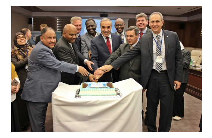
Arab Conference in Turkey

The three days Conference was organized and hosted by the Statistical, Economic and Social Research and Training Centre for Islamic Countries (SESRIC), in collaboration and partnership with ESCWA, United Nations Statistics Division (UNSD), Islamic Development Bank (IDB), Statistical Centre for the Cooperation Council for the Arab Countries of the Gulf (GCC-STAT), and Arab Institute for Training and Research in Statistics (AITRS).