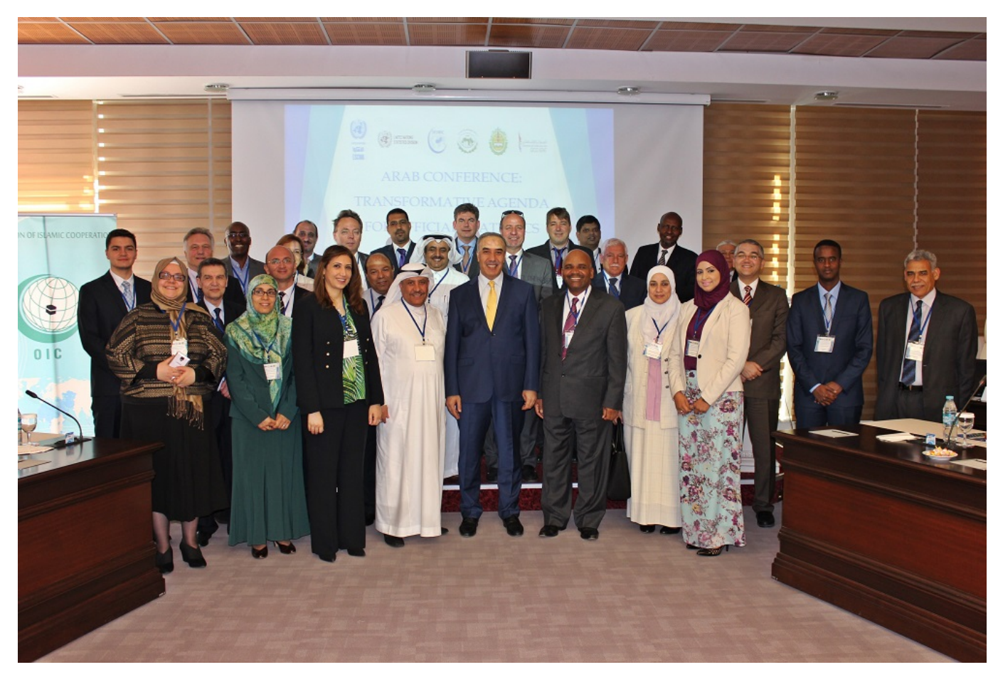
First Arab Conference on a Transformative Agenda for Official Statistics in Ankara, Turkey