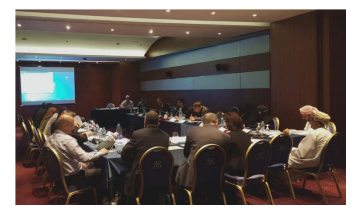
EGM on Short Term Statistics in Jordan

<u>Statistics</u> during the period 16 -18 February 2016 in Amman, Jordan. The meeting was held in the context of the project "Strengthening the Statistical Capacity of ESCWA Member Countries in Producing and Disseminating Short-term Economic Indicators for Sustainable Growth", in coordination with the United Nations Statistics Division (UNSD).