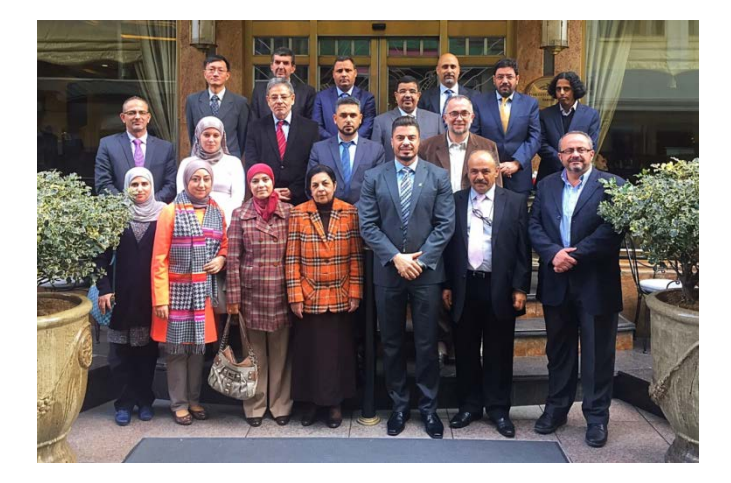
EGM on Financial Services and Business Registers in Turkey

ESCWA organized an Expert Group Meeting (EGM) on Financial Services and Business Register in the context of supporting the national statistical capacities in the area of Economic Statistics in general and National Accounts in particular, during the period November 25-27, 2015 in Istanbul, Turkey.