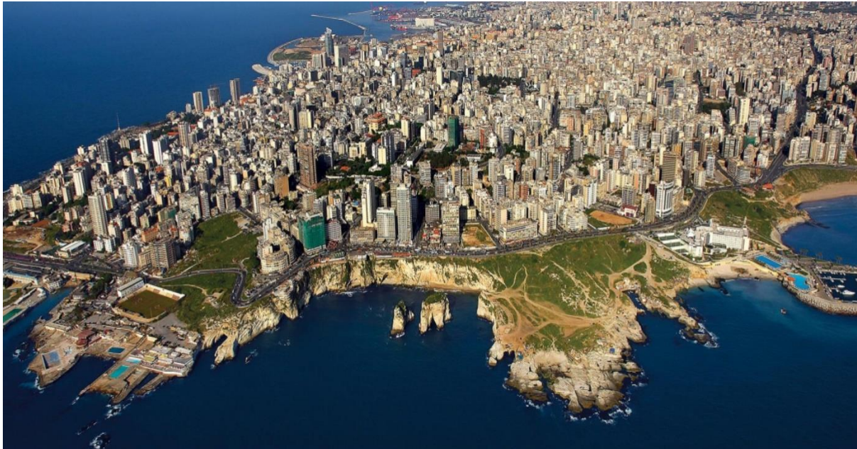
Aerial view of Beirut