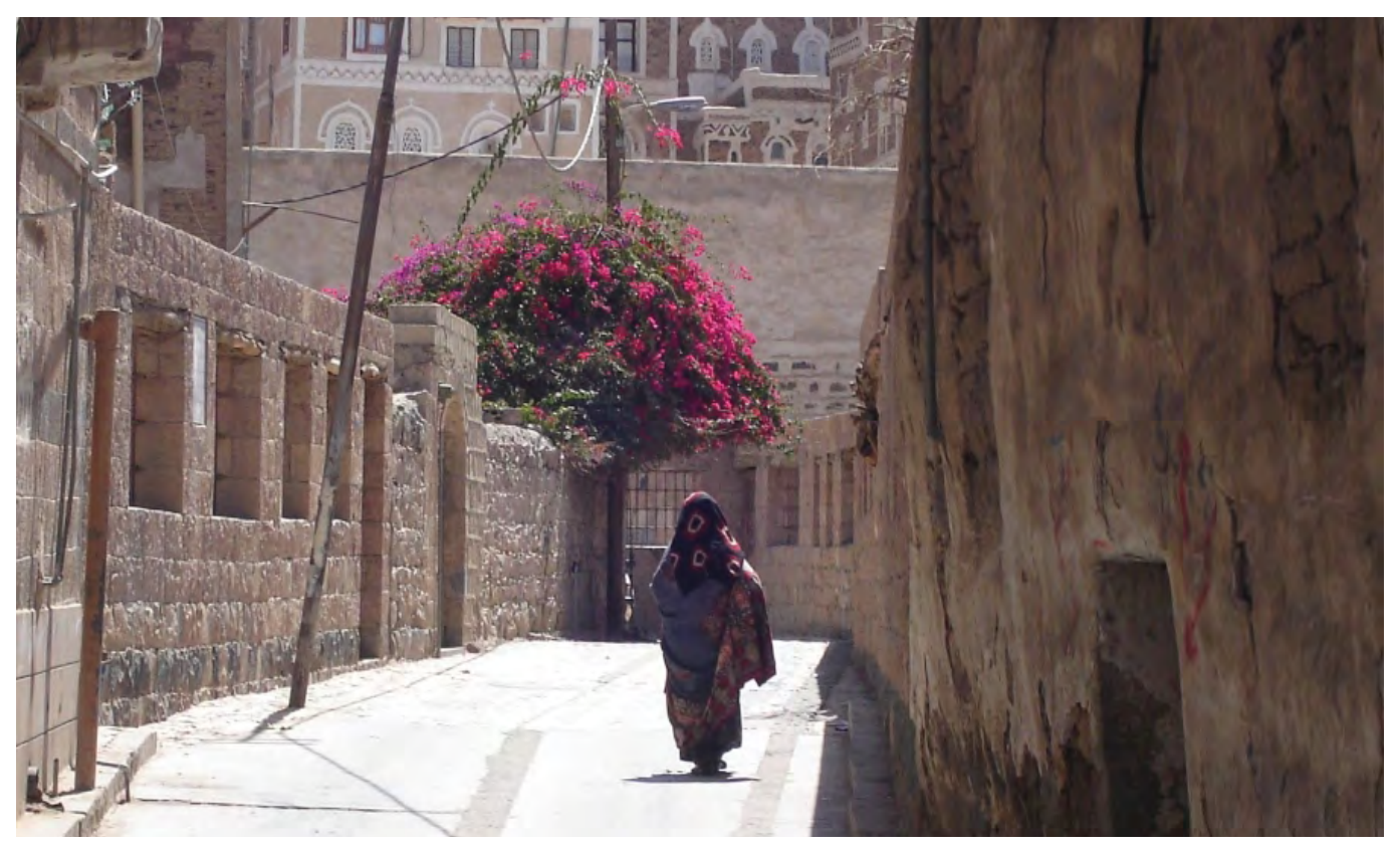
Sanaa Woman - Yemen

Integrating a Gender Perspective in the Implementation of Sustainable Development Goals 1 and 2 in the Arab Region