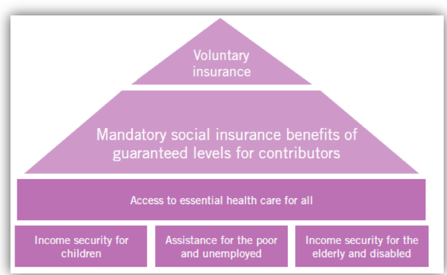
Figure I. The 'Social Security House'

The social protection floor is based on the principle of solidarity, whereby social security is seen as a human right, in line with the Universal Declaration of Human Rights (articles 22 and 25). By promoting universal access, the initiative focuses on reducing inequalities and providing support to the most vulnerable. It encourages the adoption of policies linking social protection to other areas of human development and attributes to the State a key role as regulator and ultimate guarantor of social protection systems (given that basic social security guarantees should be established by law). The State oversees social protection schemes and engages with stakeholders. Under this approach, contributors and providers of funding can participate in the running of existing schemes.