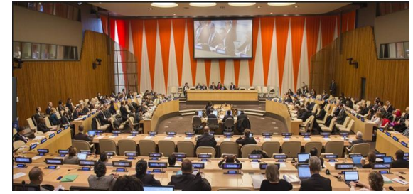
UN EcoSoc Chamber