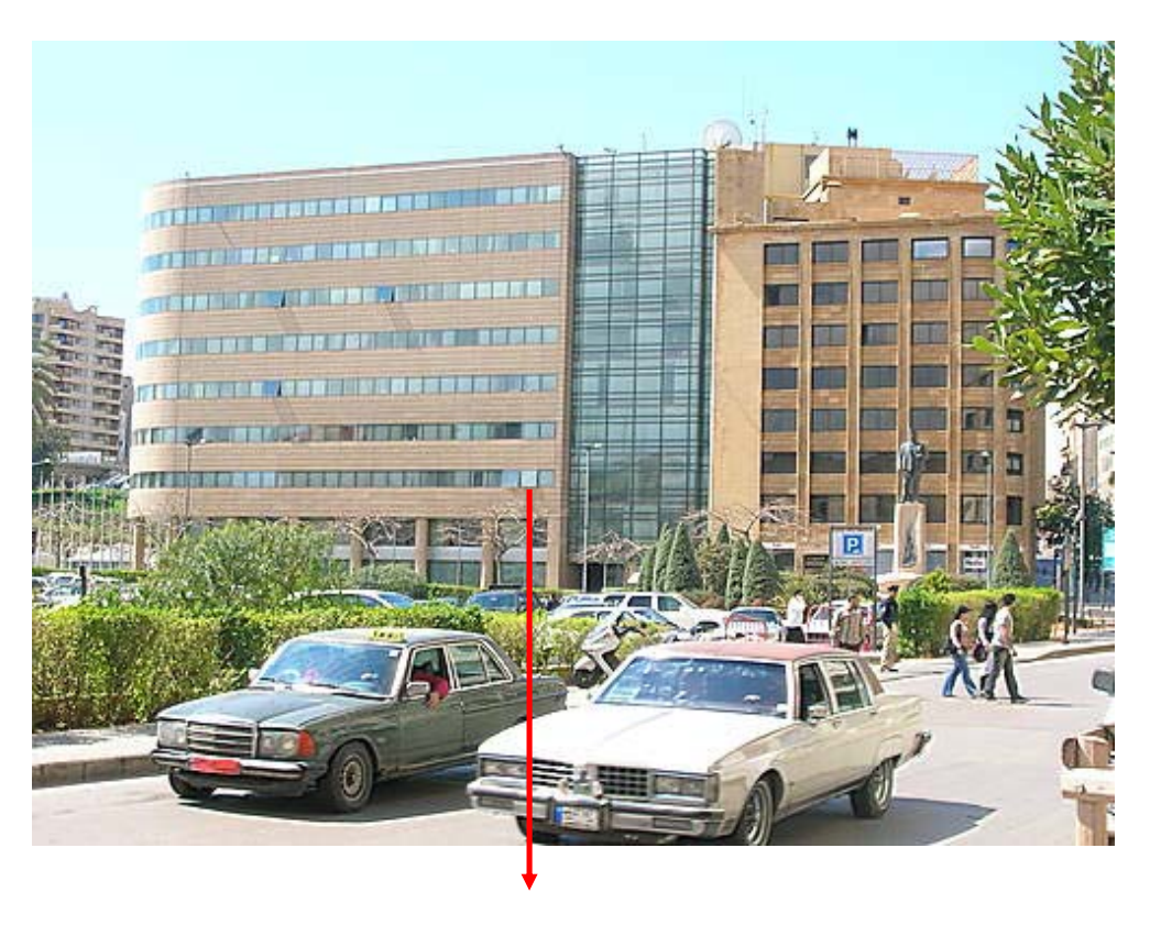
The UN House Building in Riad El Solh, Downtown Beirut