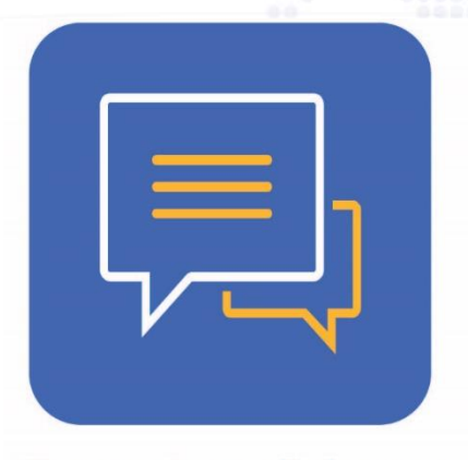
Generate a dialogue on well-managed migration