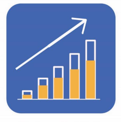
Help establish baselines to track progress on national and international commitments