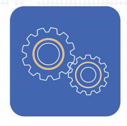
Assist in developing comprehensive migration strategies