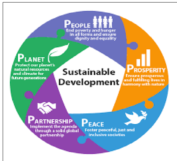
Figure 1. Five key elements underpinning SDG logic

Source: One World Centre, Agenda 2030 and the SDGs, 2017.