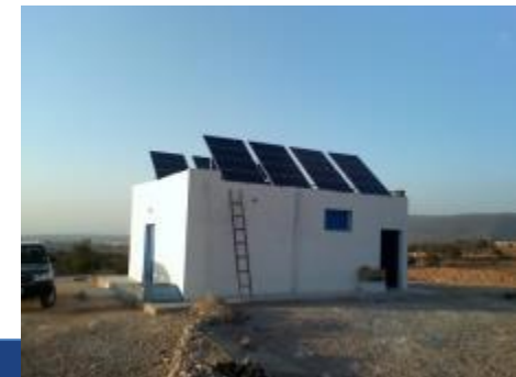
PV field (4 kWp)