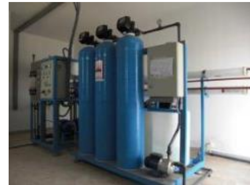
RO unit (1 m 3 /h).