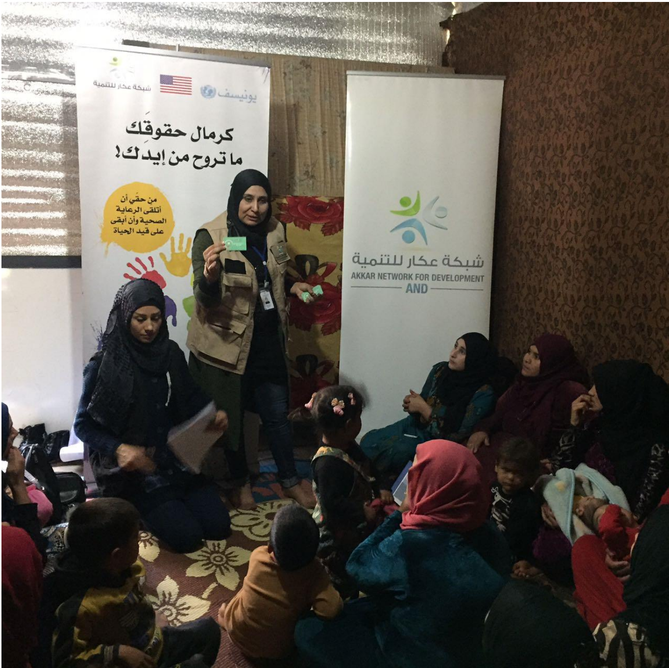
AND staff providing awareness sessions to caregivers