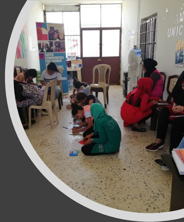
Focused Psychosocial Support Curriculum – Life skills through drama (Photo above)