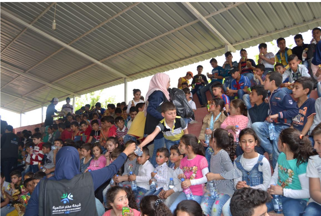
Children participating in the community event