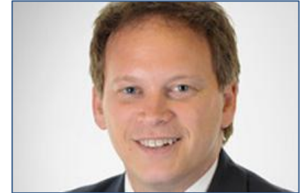
Minister of State