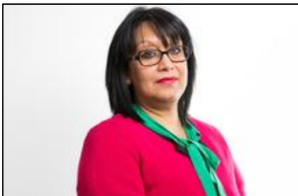
Parliamentary Under Secretary of State