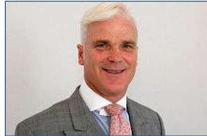
Minister of State