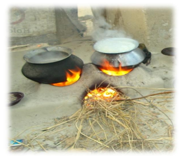
Traditional cooking stove