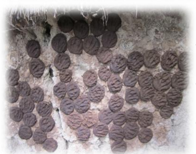
Traditional use of cow-dung