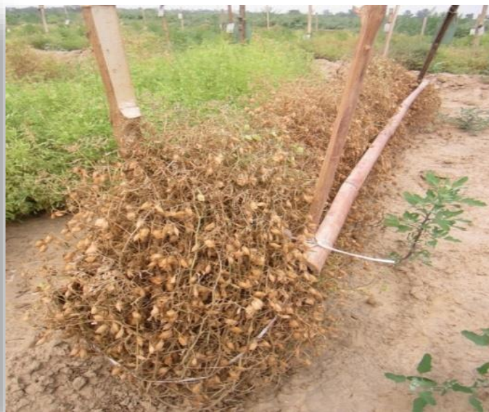
Super-early lentil (<90 days)