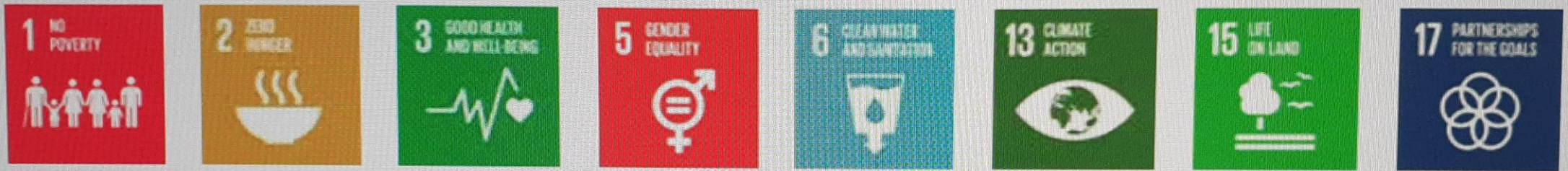
Sustainable Development Goals

Our Strategic Plan aligns with the CGIAR Strategy and Results Framework and eight of the United Nations' Sustainable Development Goals: Goal 1, No Poverty; Goal 2, Zero Hunger; Goal 3, Good Health; Goal 5, Gender Equality; Goal 6, Clean Water and Sanitation; Goal 13, Climate Action; Goal 15, Life on Land; and Goal 17, Partnerships for the Goals. It addresses the significant challenges facing the world's non-tropical dry areas: rising temperatures, critical water scarcity, fragile natural resources, and an insecure food and nutritional future under often-unstable social conditions.