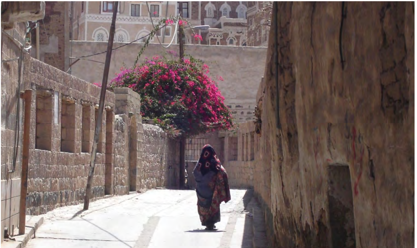
Sanaa Woman - Yemen

Integrating a Gender Perspective in the Implementation of Sustainable Development Goals 1 and 2 in the Arab Region