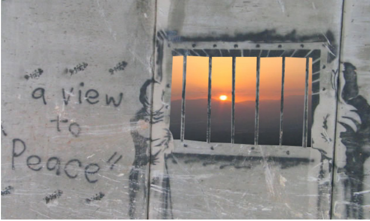
Ian Burt (CC BY 2.0)

Article 76: "Protected persons accused of offenses shall be detained in the occupied country, and if convicted they shall serve their sentences therein."