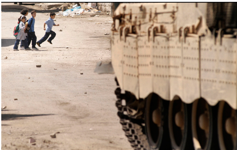
Pieter Stockmans (CC BY 2.0)

Israeli authorities with regard to Palestinian education facilities in the West Bank;