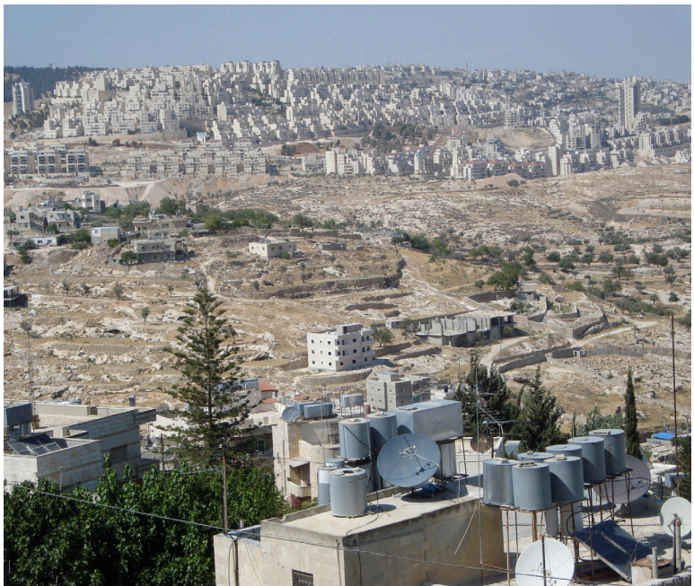
Pieter Stockmans (CC BY 2.0)