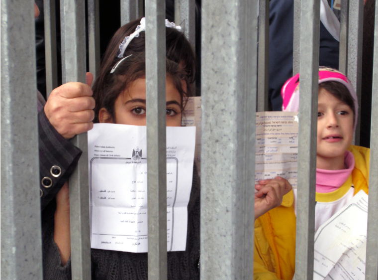
Scott Campbell (CC BY 2.0)