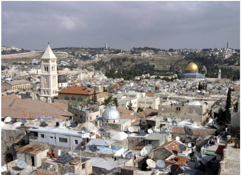
Justin McIntosh (CC BY 2.0)