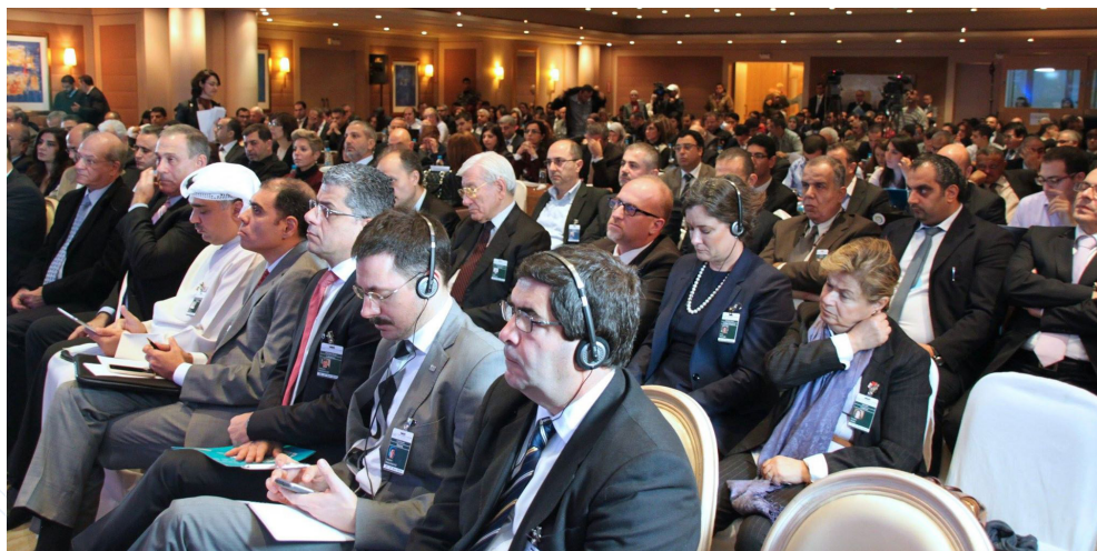
Participation in the AIGF-III (Beirut, 26-27 November 2014)

logistical and organizational preparations for the meeting by the host entity.