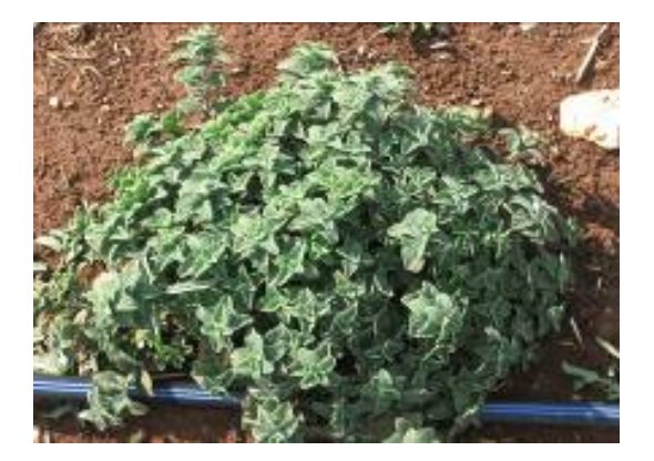
A thyme plant grown by the model project implemented in Bint Jbeil, South Lebanon