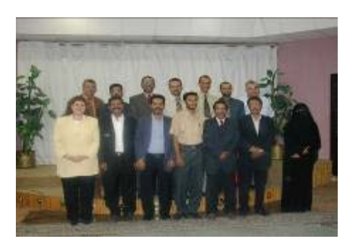
Members of the National Commission for Trade and Environment of Yemen and ESCWA consultants who contributed to its establishment

a. A workshop in Sana'a in May 2006, which targeted members of the National Commission for Trade and Environment. The Commission was established with the technical support of ESCWA, which drafted two studies to support the programme of work of the Commission for 2006. The first study deals with the legislative framework of trade and environment in Yemen, while the second deals with the fishing sector and ways of improving its competitiveness and sustainability;